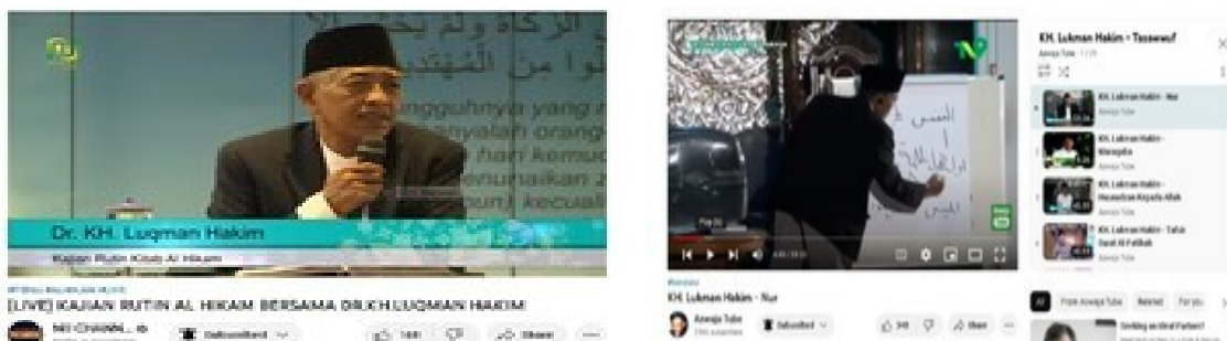
Figure 5 and 6. YouTube channel views @Aswajatube and @NUchannel