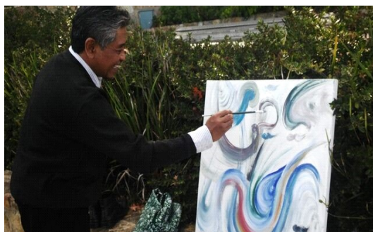
Figure 2. Photo of Shaykh KH. M. Luqman Hakim's Sufistic painting