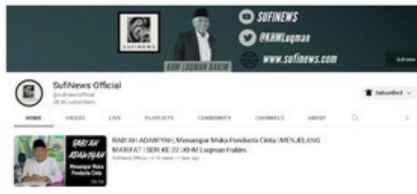
Figure 4. YouTube channel view @Sufinewsofficial